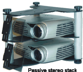
Passive stereo stack

VIZCAN's WALLdesign-1 is high quality at an affordable price. All components of a WALLdesign system are selected to represent the best-of-breed technologies. Many of VIZCAN's WALLdesign-1 designs incorporate non-traditional configurations running from non-traditional Image Generators in non-traditional roles.