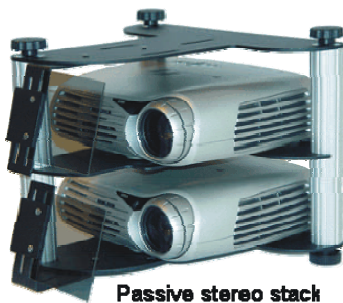
Passive stereo stack

VIZCAN's WALLdesign-2™ is high quality at an affordable price. All components of a WALLdesign-2™ system are selected to represent the best-of-breed technologies. Many of VIZCAN's WALLdesign-2™ designs incorporate non-traditional configurations running from non-traditional Image Generators in non-traditional roles.